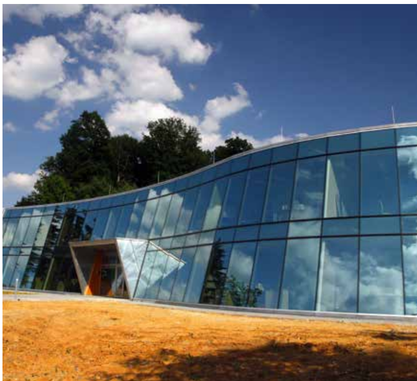
Office Building Lesy ČR - Zlín - Czech Republic - Stopsol Supersilver Green