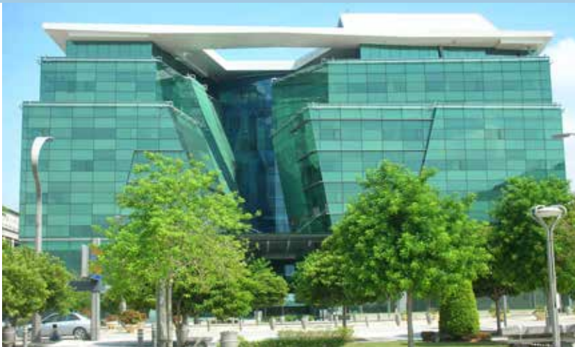
Putrajaya 3C4 - Putrajaya - Malaysia - Stopsol Classic Green

Never write on the coating of the glass. Moreover, no cutting tools, pointed tools or hard tools that could damage the coating should be used.