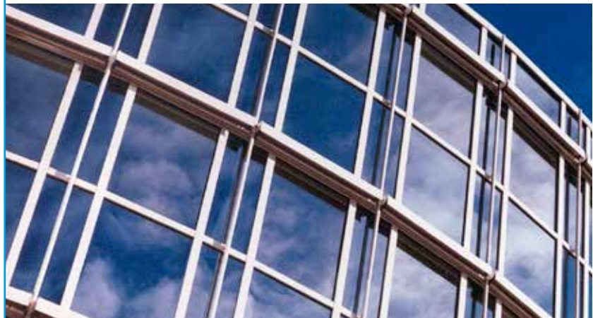
Alterspark BV - Hamburg - Germany - Stopsol Supersilver Clear

Thanks to the wealth of choice of colours available in the Planibel range as well as three types of coating, Stopsol offers the possibility of more than 10 different aesthetic solutions. The final appearance of the glass will depend on the substrate (Clear, Grey, Bronze, Green, PrivaBlue, Dark Blue), the coating (Classic - glass with a slightly amber reflection, Supersilver - glass with a silver, slightly bluish reflection, SilverLight - glass with a lower degree of reflection with a bluish hue), the thickness and the position of the coating. If the coating is placed to the outside, the appearance will be influenced by the surrounding environment and will have an increased level of reflection, if it is placed to the inside then the appearance will be more influenced by the colour of the float.