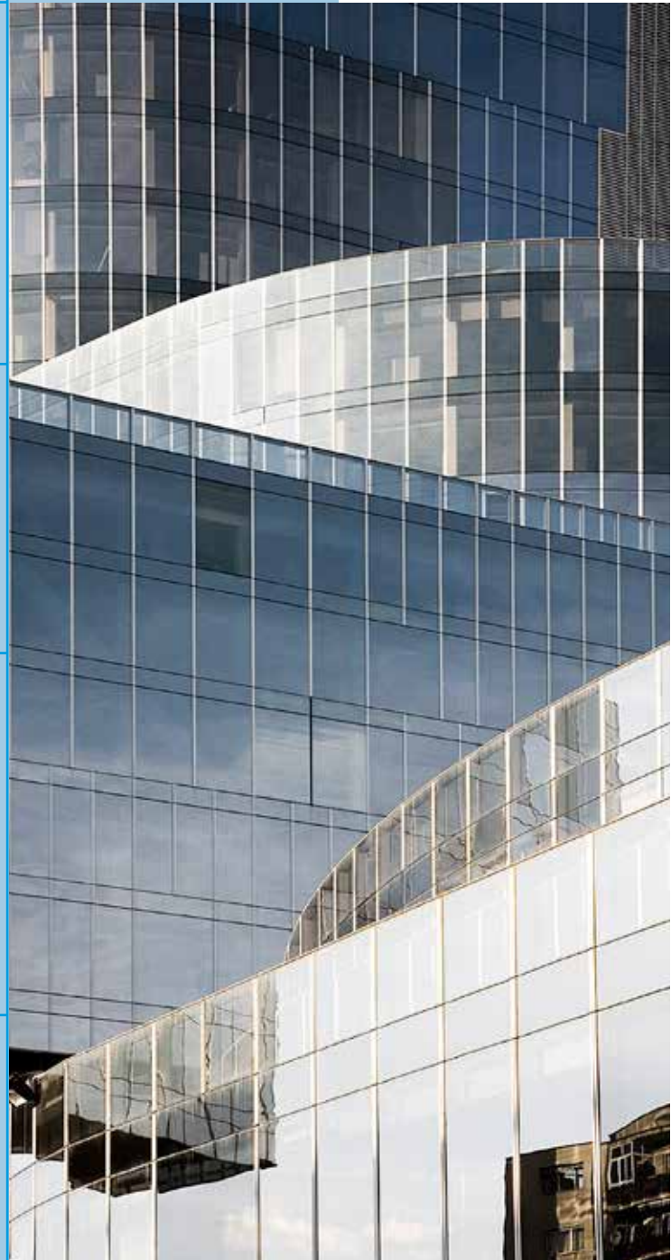
Torre Gas Natural - Barcelona - Spain - Stopsol Classic Clear

For more information, please consult the Stopsol Processing Guide on www.yourglass.com