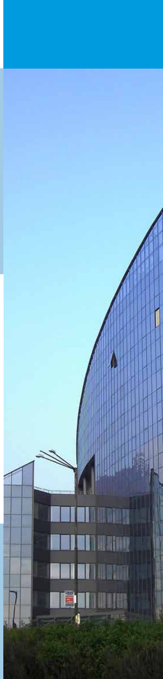
Cover picture: Torre Gas Natural - Barcelona - Spain - Stopsol Supersilver Grey